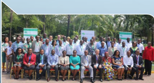
First National Workshop by the Maritime Technology Cooperation Centre (MTCC) Africa.