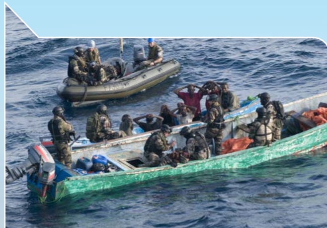
Military Intervention by Kenyan Troops off the Coast of Somalia