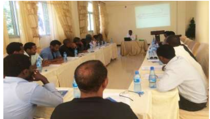
Formal training and professional development