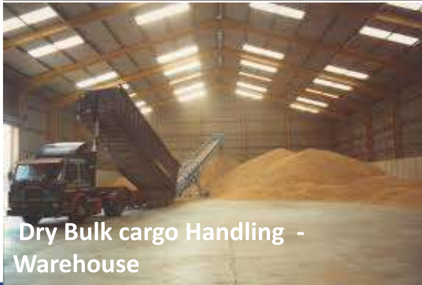
Dry Bulk cargo Handling - Warehouse