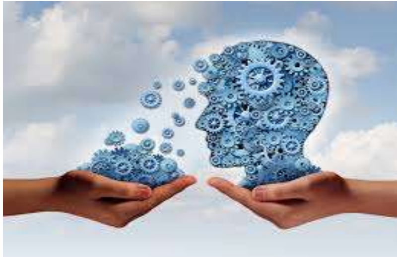
Mentorship and coaching