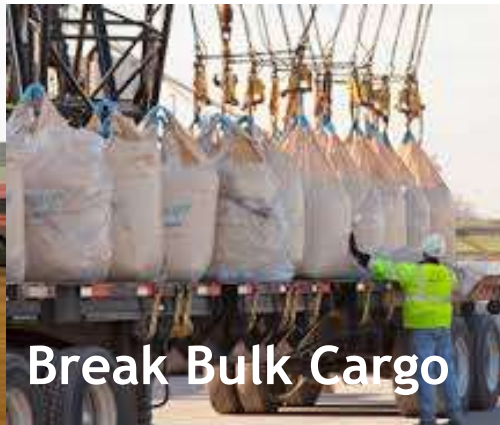
Break Bulk Cargo